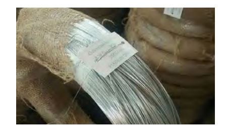
PLASTIC FILM AND HESSIAN CLOTH PACKAGE